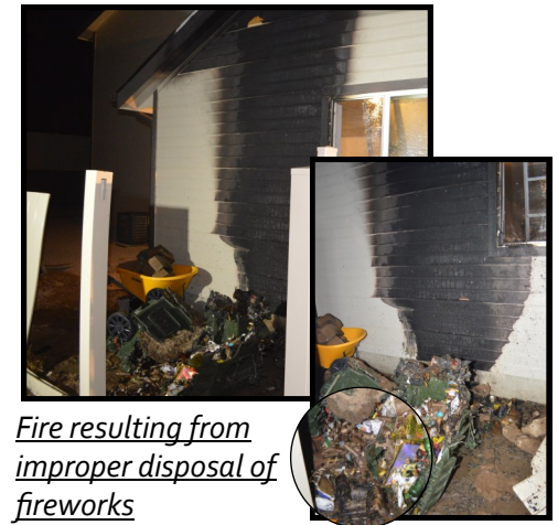
Fire resulting from improper disposal of fireworks

Dispose of fireworks properly by soaking in a bucket of water overnight before disposing them in the trash.